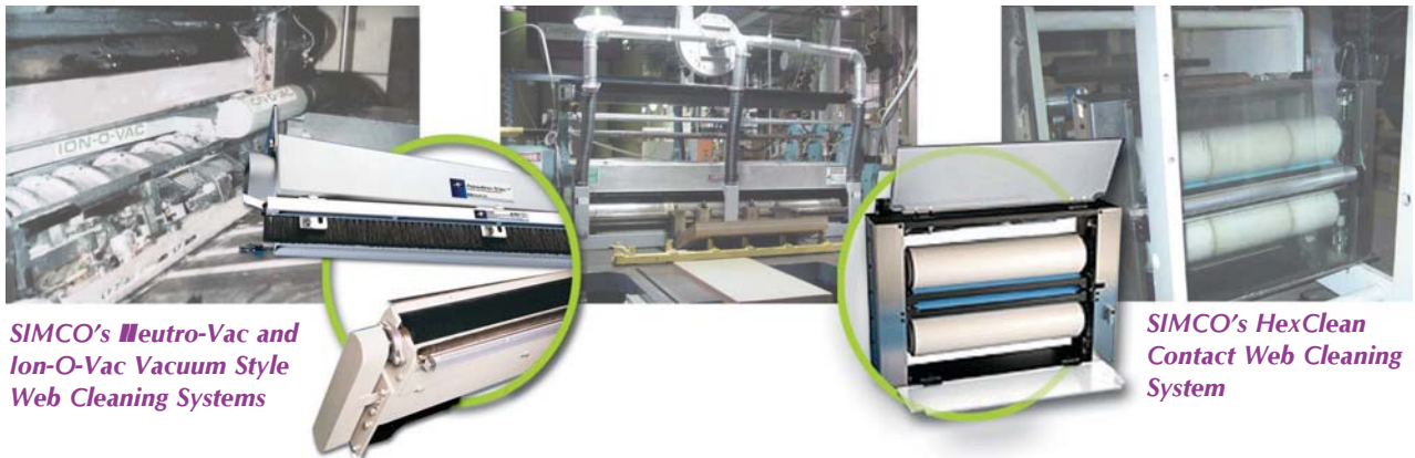
SIMCO's Neutro-Vac and Ion-O-Vac Vacuum Style Web Cleaning Systems

SIMCO offers contact and non-contact web cleaning systems.